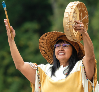
A message from the North and West Vancouver Teachers' Association